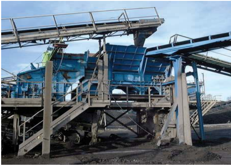
Fig.3: Grading machine for crushed steel slag

The process used to condition the slag for use in road building is similar to the technology used to break and grade natural mineral aggregates to defined shapes and sizes.