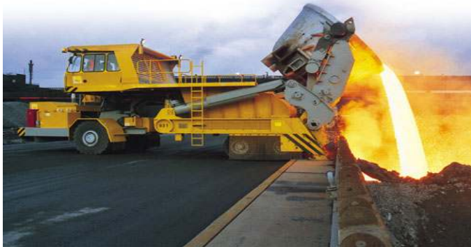
Fig2: Steel slag poured into a cooling bed

only the non metallic components from iron ore or other additives, also calcium carbonate and dolomite that is added in steel manufacturing ends up in the slag. Steel slag is classified in Germany according to the steel production method it is produced with. LD-slag is produced by the Linz-Donawitz-Method. The other important category is EO-slag or EOS, coming from Electric arc furnaces, also named electric ovens. These two products are the ones available to the market. The slag is either slowly cooled down in beds (fig.2) and weathered for some time to reduce the reactive potential of unbound calcium carbonate or quartz sand or oxygen are added to the molten slag to bind the calcium carbonate so that the weathering becomes obsolete.